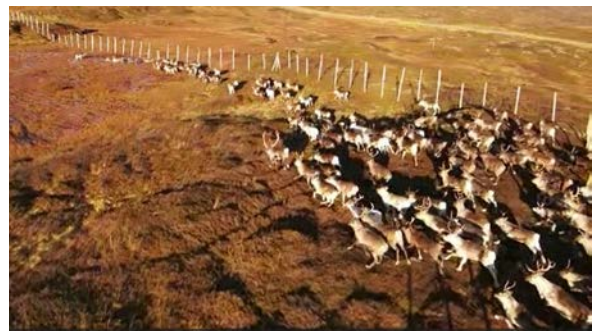
Figur 3 Drones can find and herd reindeer from rangelands towards fences (left). A herd is driven into a fence by two drones instead of four ATVs (right).