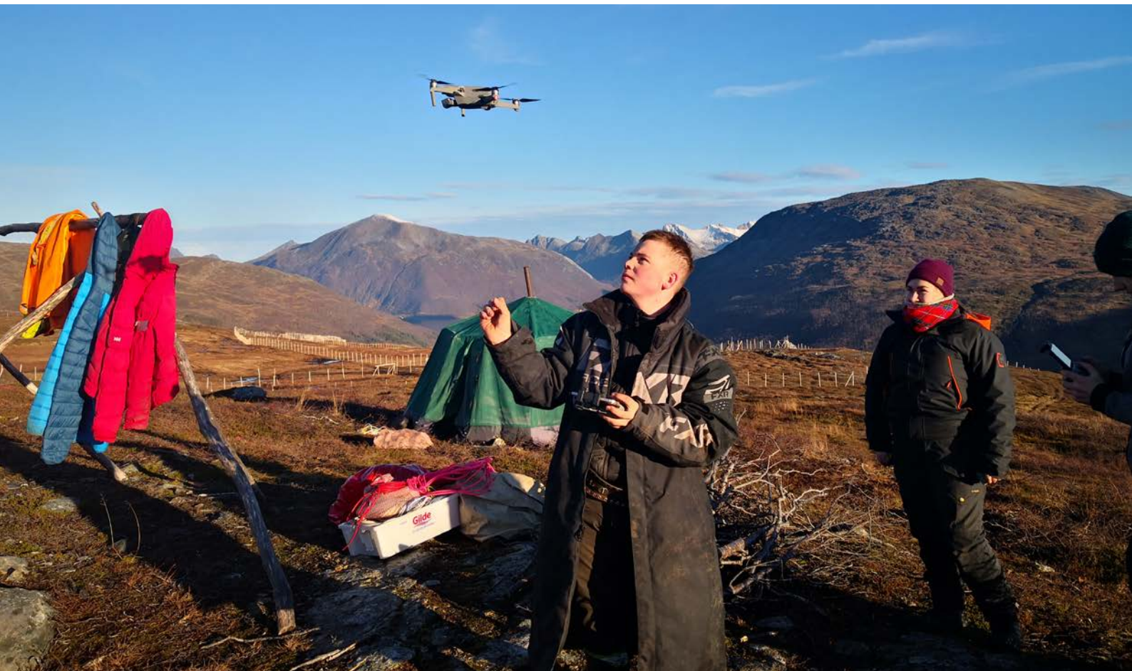
Figur 1 Drones are increasingly used in traditional reindeer herding.