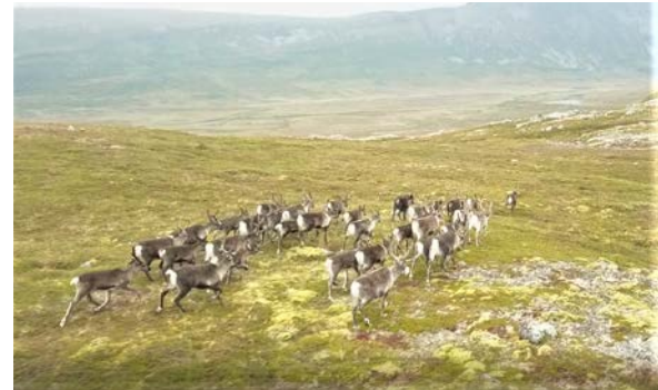
Figur 4 Drones can be used to chase animals out of dangerous situations such as avalanche exposed terrain (top left), to monitor animal behaviour at close range in inaccessible terrain or during bad visibility (top right), to find animals in forested areas in which the ground view offers too small a perspective (bottom left) or to find and move animals in large open rangelands (bottom right).