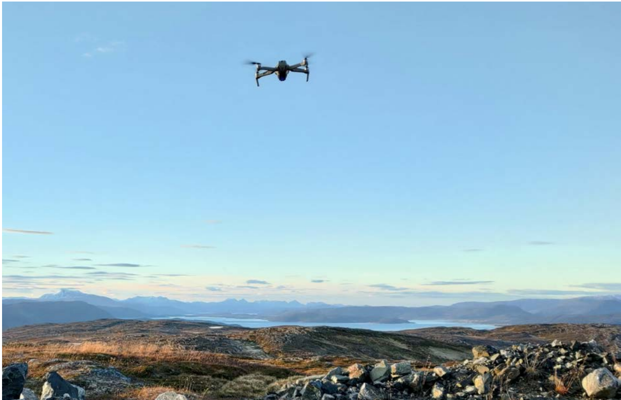
Figur 2 A light drone fits into a backpack and can easily be used to survey inaccessible terrain.